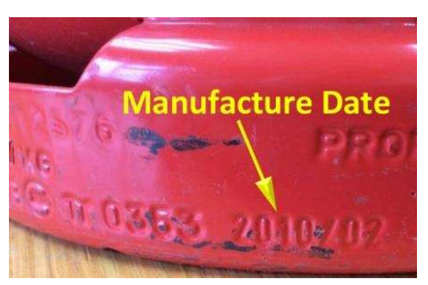
Illustration shows manufacture date of 2010 (i.e. AP 10 B)

At the very bottom of the base ring the third row of text shows the date of manufacture i.e. 2008, 2009, 2010 or 2011.